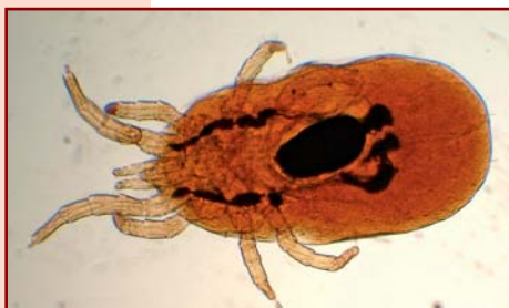
Adult red mite ( Dermanyssus gallinae )

( Dermanyssus gallinae)