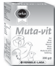
Muta-vit Special moulthing vitamins

Pro feather: in addition to the VAM-pellets with vitamins, amino acids and minerals 2% chia-seed provides the necessary fatty acids